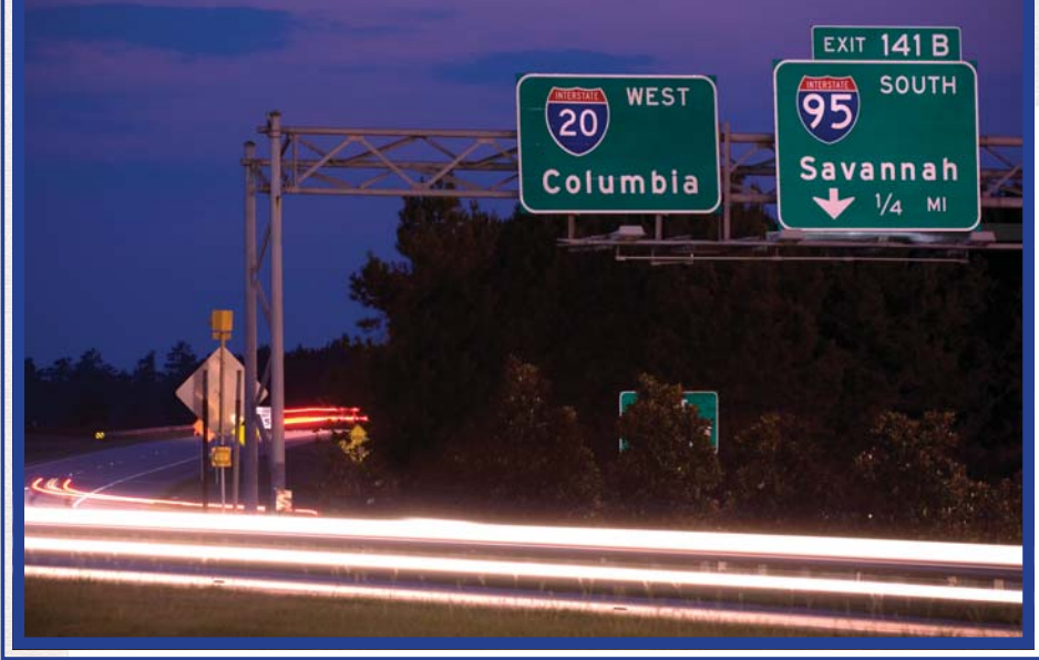
Florence intersects with I-20 and I-95.